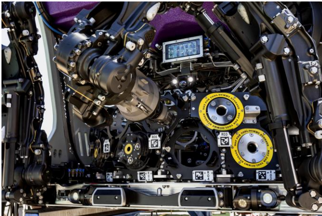
GEMINI® ROV Tooling Carousel with Capacity for 15 Tools and Automatic Acquisition by Port or Starboard Manipulators