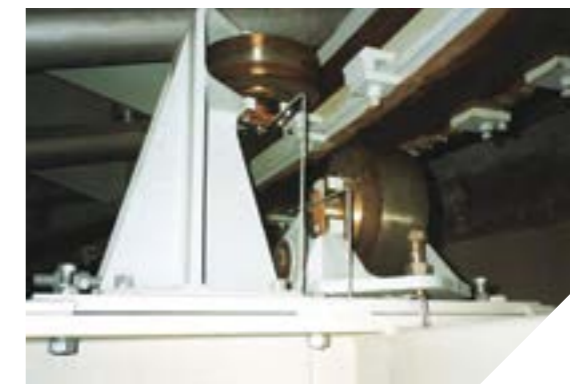
Support and centering rollers

The cloths are cleaned under pressure by two spray banks fed by one or two central manifolds. Residual gypsum is removed and cloths and table are washed to prevent scaling.