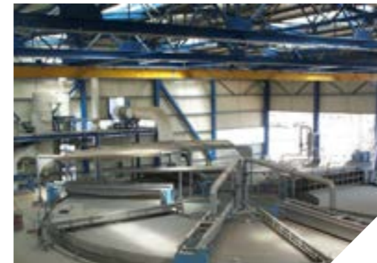
UCEGO no. 12 A