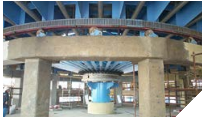
Table drive unit

The stainless steel screw is adjustable in height, and equipped with replaceable wear flights.