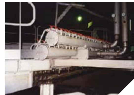
Cloth and table washing

The upper part of the filter valve is easily raised for fast inspection or adjustment