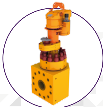
20K HPHT Subsea Choke